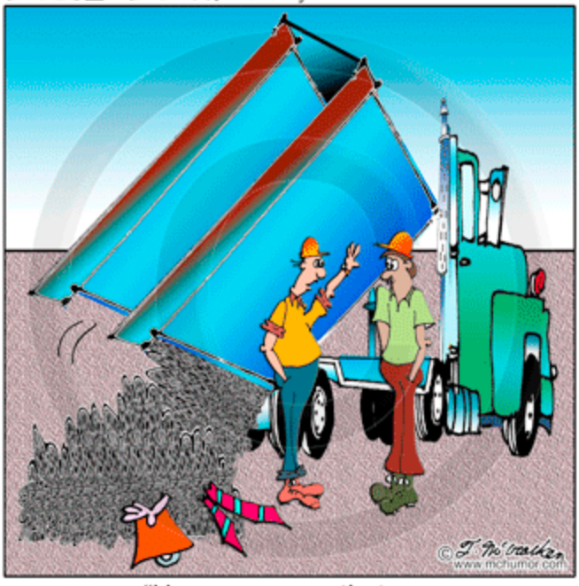
"Have you seen that new safety inspector anywhere?"